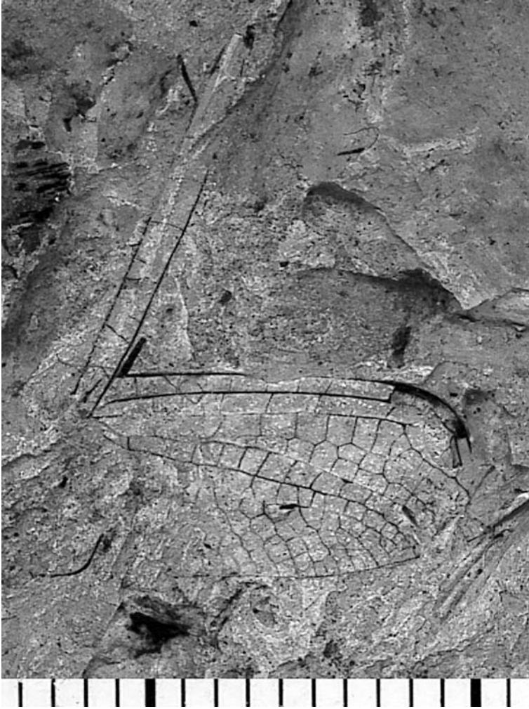
Fig. 5. Parabrachydiplax miocenica n. gen. n. sp., holotype P569, wing. Scale as indicated by the ruler.

genus Thermochoria ). A pseudo-IR1 originates on RP1 beneath the basal third of the pterostigma. A convex apical supplement sector is present but relatively weakly developed. Three rows of cells between pseudo-IR1 and RP2.