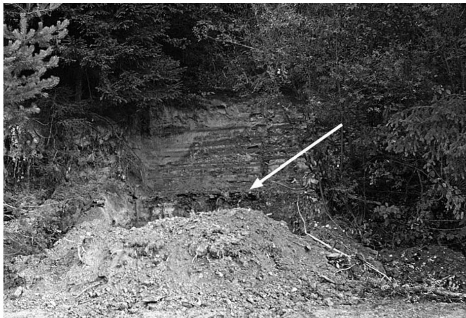
Fig. 2. During the construction of a highway in 1973 the fossiliferous sediments of Heggbach were again exposed. At the base of the dark-coloured coaly horizon, indicated by the arrow, J. PROBST discovered the holotype of Parabrachydiplax miocenica n. gen. n. sp..